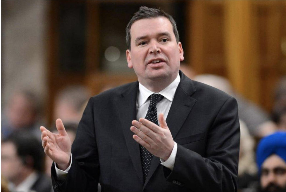
Minister of Industry Christian Paradis responds to a question during question period in the House of Commons on Parliament Hill in Ottawa on Monday March 4, 2013.